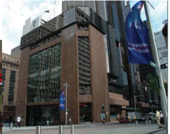
Major television network located in the CBD - 800m 2 of 350 micron security film